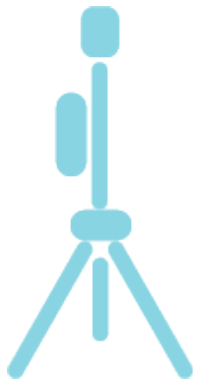
BEAM Weather Station

The Vaisala solutions that ports need to navigate wind, precipitation and storm surges