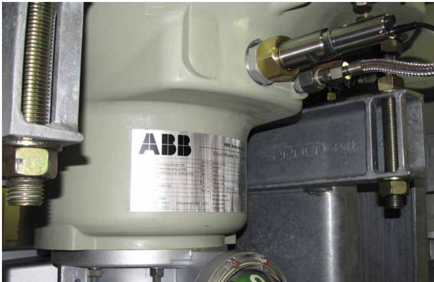
Figure 5. Installation of a dew point-pressure-temperature sensor (DPT145) directly to the main gas tank (25.3– 14.4.2010). The gas volume in the measurement cell is roughly 20 ml.

It is therefore very important to minimize the introduction of initial moisture during installation. In order to avoid water droplets getting into the sensor connector, installation should not be carried out during rainy weather conditions. Great care should also be taken to ensure that no dust or dirt particles remain on the sealing surfaces, because these may later act as a medium for the diffusion of water molecules, ruining the measurement and, in the worst case, cause wetting of the SF 6 . In outdoor installations, a rain shield should be used to prevent water from gathering on the connection points and increasing vapor diffusion.