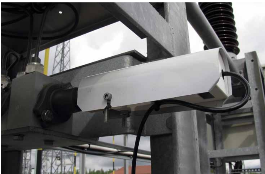
Figure 2: Outdoor installation into a "sensor block".

This kind of setup would not be problematic in the case of pressure or density measurements, but with dew point measurement such installations may result in incorrect conclusions. The volume of water vapor relating to the transients in the gas line is extremely small, but it becomes visible during online measurement in a small volume of static gas.